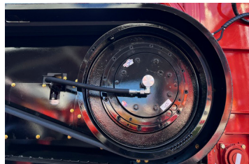
External Adjustable Break-Away Torque Limiter