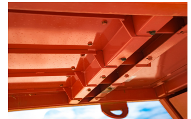
Removable Infeed Floor